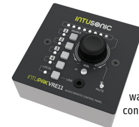
VRE11 Optional wall remote control panel